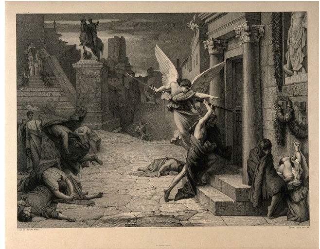
The angel of death striking a door during the plague of Rome, Jules-Elie Delaunay; Aesculapius

Romans were not dying in hospitals or on pain medication. They were suffering the plague until the bitter end with some ordinary symptoms of illness: “fever, diarrhea, vomiting, thirstiness, swollen throat, and coughing” and some symptoms of more disgusting nature: “skin eruptions or rash, over the entirety of the body distinguished by