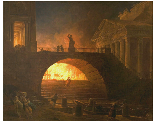
Fire in Rome by Hubert Robert

Since the birth of civilization, fires have fought to reduce decade- or even century-old urban metropolises to the rubble and ashes of their entropic destinies in just a few days. Many of the largest and oldest cities are those that were able to adapt to the fiery inevitability, each with "Great fire" events prefixing their name (The Great Fire of... London, Chicago, New York, etc). Ancient Rome was no different: in its 1000 year history, an approximate 88 fires were documented by various scholars and historians as they happened (Desmond 137). In ancient Rome, once-in-a-generation fires were common, and were responsible for scenes as seen in the painting above by Hubert Robert. The particularly winding streets and unsymmetric domains of the ancient city, still seen in the layout of modern Rome, made it difficult to navigate and escape. This fact led Margaret Desmond, in her thesis on fires in Rome, to conclude that "Rome, a city teeming with naked flame, was an accident waiting to happen" (Desmond 152). And indeed it was, many times over.