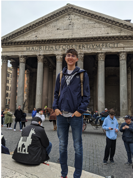
A photo of me standing in front of the Pantheon, a monument that could tell a story or two if it could talk, Rome, Italy

For the first month and half, my time in Rome mirrored that of any student studying abroad there: getting comfortable with the new language, navigating foreign grocery stores, getting to know some of my best friends for life, and traveling with them across Europe. Then—as nearly all 7 billion of us know now—COVID-19 arrived in northern Italy. At the time, none of us, including my teachers, friends and many Italian locals, knew just what we were dealing with. In our minds, our experience with Ebola, HIV, and AIDS, while certainly epidemics, prompted us to treat COVID-19 with just the same nonchalance—as something “happening over there.” Thus, it was after many internal crises, emotional debates on phone calls, panic attacks in my dorm’s elevator, and decree’s from the Italian and US governments, that I went home—one of the most challenging decisions of my entire 21-year life.